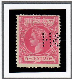
Scott #201 (Mint)