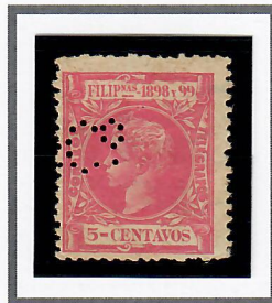
Scott #201 (Mint)