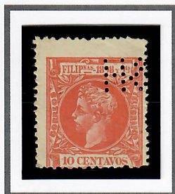
Scott #204 (Mint)