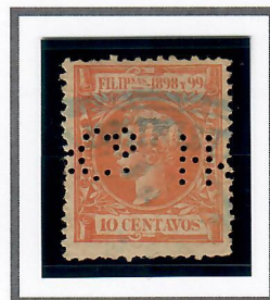
Scott #204 (Used)