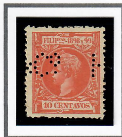
Scott #204 (Mint)