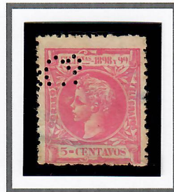
Scott #201 (Mint)