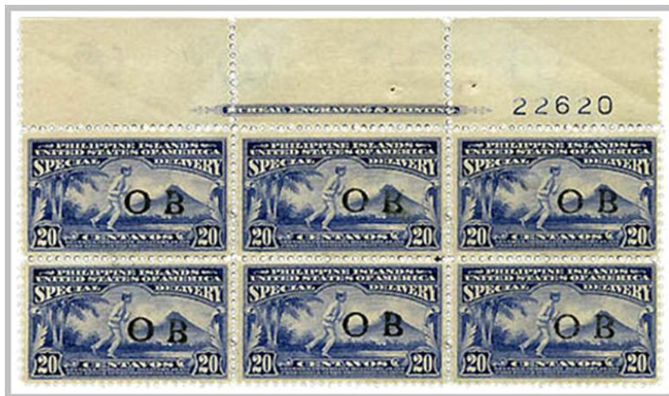
Deep ultramarine to pale ultramarine colors

Note: As shown above, these particular E3 stamps have OB overprints in a more fixed or definite horizontal location. This observation suggests that the possibility of a special printing plate of 50 OB clichés existed. FYI, a pane of these stamps has 50 subjects. The printing of the letters is more shifted to the right-hand side. Parts of the letters are also poorly printed while the OB overprints on the regular definitive stamps have finer and more homogenous printing. Again, could this printing process involved a manual operation?