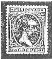
2 4/8c. de Peso Blue (6,000,000)

After the death of King Alfonso XII on November 25, 1885, his wife, Ma. Christina of Austria, was appointed regent, pending the decision as to the successor to the throne, which continued during the minority of King Alfonso XIII, born May 17, 1886.