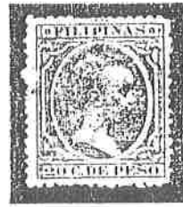
20c. de Peso Rose (30,000)