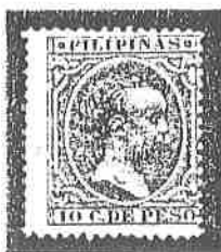
10c. de Peso Blue Green (80,000)

A new series of stamps intended for domestic use was issued on January 1, 1890, bearing the baby head of King Alfonso XIII. Typographed by the Sociedad del Timbre of Madrid, perforated 12 \frac{3}{4} \times 14 \frac{1}{2} , in sheets of 100 (10 x 10). The die used was engraved by E. Julia.