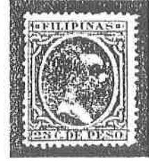
25c. de Peso Brown (80,000)

The issues of 1890-1897 Baby Heads bore an inscription at the top margin stating for what purpose each particular stamp was issued for (i.e., domestic use, postal union use, for sending medical samples, etc...). However, this was not followed as stamps were used indiscriminately to meet postal demands.