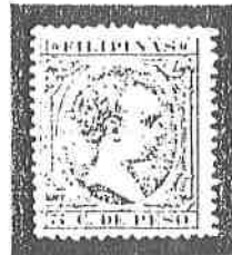
5c. de Peso Slate Green (120,000)

A new series of stamps intended for domestic use was issued on January 1, 1890, bearing the baby head of King Alfonso XIII. Typographed by the Sociedad del Timbre of Madrid, perforated 12 \frac{3}{4} \times 14 \frac{1}{2} , in sheets of 100 (10 x 10). The die used was engraved by E. Julia.