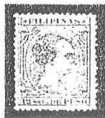
12 4/8c. de Peso Pale Green (525,000)