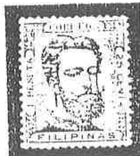
1 Peso 25 centimos Bistre Brown