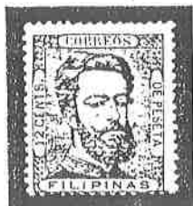
12 centimos Rose

The second series of the King Amadeus stamps were made available in Manila on October 15, 1872. Typographed by Fabrica Nacional de Timbre of Madrid, in sheets of 100 (10 x 10), perforated 14. The only difference lies on the figures and letters of the values: The October issue has single right and left frame lines, while the May issue has double.