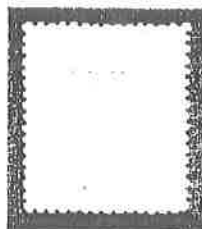
62 centimos Pale Mauve