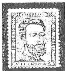
16 centimos Blue

A new regular issue was made available in Manila on May 8, 1872, bearing the portrait of Amadeus of Aosta (Sardina), second son of Victor Emmanuel of Italy, who was crowned King of Spain on November 16, 1870. The stamps were typographed by Fabrica Nacional de Timbre of Madrid, in sheets of 100 (10 x 10), perforated 14. The value was expressed in centimos de peseta: 10 centimos = 1 peseta; 8 reales = 2 escudo = 5 peseta = 1 peso fuerte.