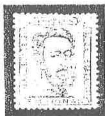
25 centimos Gray Lilac