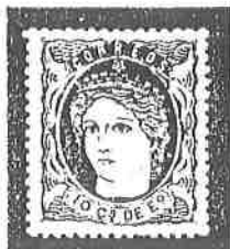
10 centimos Deep Green.