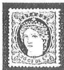
20 centimos Brown.