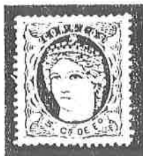
5 centimos Blue.