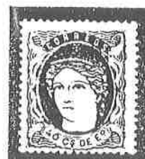
40 centimos Rose.

The monetary standard was changed which came about through an Order of March 21, 1865 and took effect on July 1, 1866. The new unit was Escudo, although the use of previous monetary unit was permitted until things were all settled. The value of the Escudo was fixed at 100 centimos = 1 Escudo; 4 Reales = 1 Escudo; \frac{1}{2} Peso Fuerte = 1 Escudo.