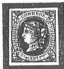
3 1/8 centimos ( 5 cuartos ) Buff

On January 1, 1864, a new set of stamps was issued in Manila. Printed by lithographic process by Fabrica Nacional de Timbre of Madrid, the designs were engraved by Don Jose Perez, in sheets of 100 (10 x 10) on tinted paper. The monetary unit used was expressed in metric system - centimos de peso fuerte - in compliance with an Act of Law dated July 19, 1849. Thus, the rates of 5 cuartos, 10 cuartos, 1 Real, and 2 Reales were changed accordingly. All of these issues were used either for local or foreign mail, and were combined to produce the desired amount needed.