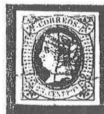
25 centimos ( 2 Reales ) Orange