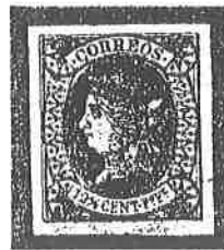
12 4/8 centimos ( 1 Real ) Blue