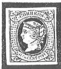
6 2/8 centimos ( 10 cuartos ) Green