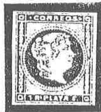
1 Real Emerald Green (5,000)