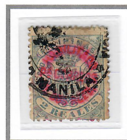
Scott #123a (PG-32 on PG-14)