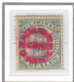
Scott #123 (PG-32 on PG-13)