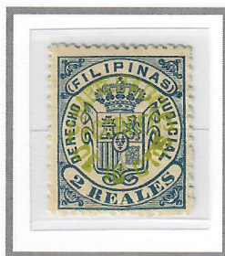
Scott #121 (PG-23)