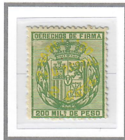
Scott #120 (PG-4)