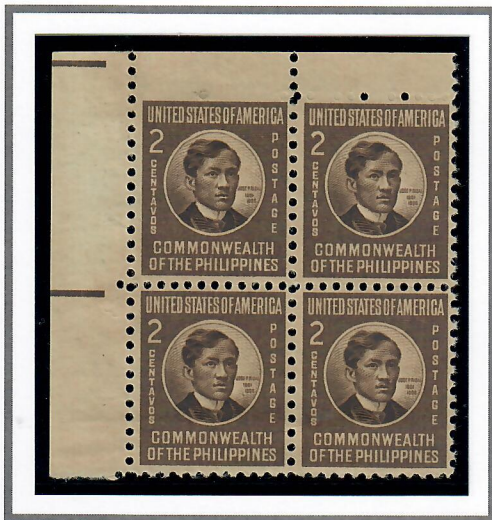
Original Base Stamps Without Overprint

PARTIALLY IMPERFORATE ON TOP HORIZONTAL PERFORATIONS AND OVERPRINT SHIFTED DOWNWARD AND LEFT 1.5MM