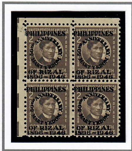
Shifted Downward and Left 1mm