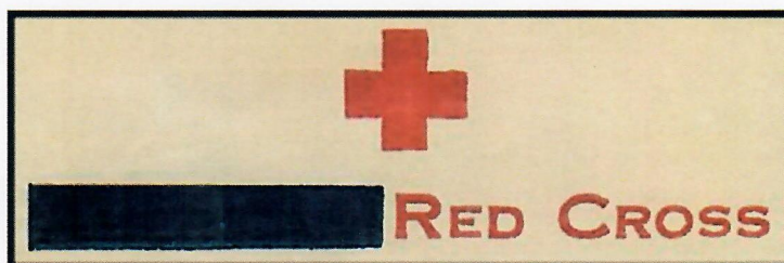
American Red Cross Logo on Reverse with the word “AMERICAN” deleted by a solid black bar