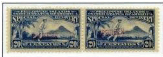
2 of the 3 recorded copies

SPECIMEN OVERPRINTS: Two types of specimen overprints are recorded on the 1919 issue, both shown below.