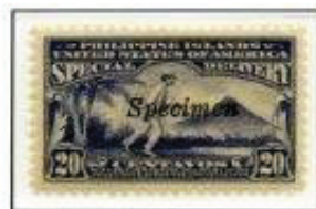
probably 50 issued

REGULAR ISSUE: The 1919 issue comes in three distinct shades, as shown below. This issue was the veritable “workhorse” of the Philippine special delivery service, with over 4,000,000 issued and in service for 20 years.