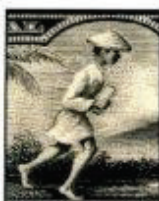
Unapproved Late Version (Below)