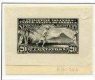
On Wove Paper, Mounted on Small Card only recorded copy

Letter Design : Unapproved Design for Word- ing of "Special Delivery"