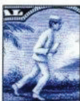
Final Approved Version (Page 5)

The Saint Paul Pioneer Press, St. Paul, Minnesota. Sunday May 6, 1906. First Section, Page 4, Column 7.