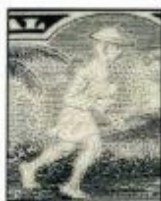
Unapproved Early Version (Page 3)