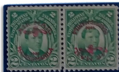
Forgery with inverted overprint