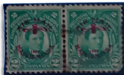
Airmail Madrid-Manila 1926