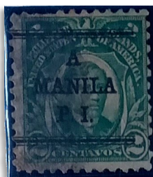
AC Alcan, Inc.