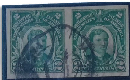
Lambert Sales Company

To Prevent misuse and theft by employees, companies were permitted to put company initials on the stamps in use.