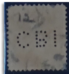
Chartered Bank of India