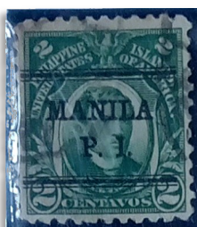
Rambler Shoe Company