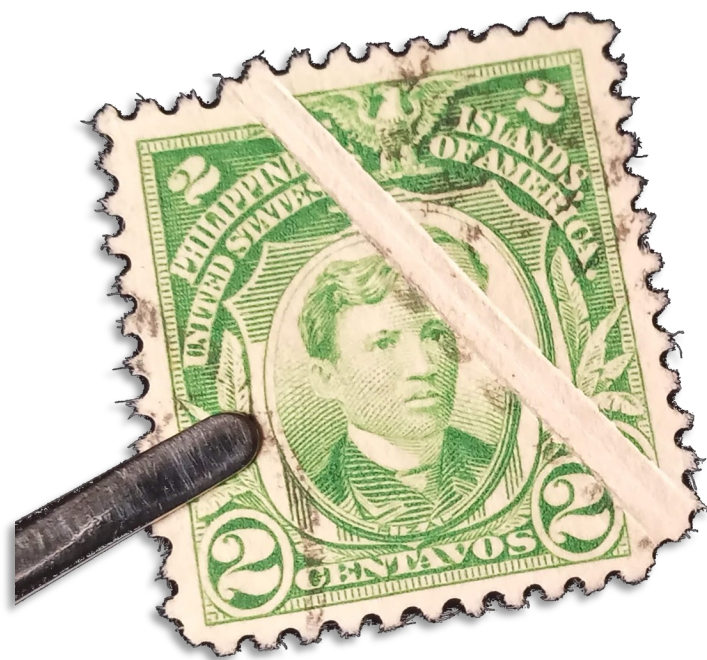
Pre-printing paper fold error