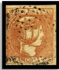
5 Cuartos orange