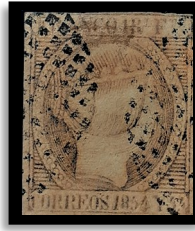
1 Real slate blue