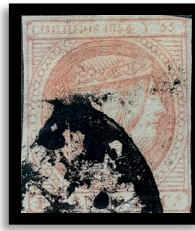
10 Cuartos pale rose