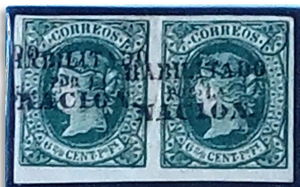
HABILITADO POR LA NACION abdication overprints

As a colony of Spain, the Philippines was one of the first countries in the continent to use postage stamps in 1854; four years after Spain issued its first stamp.