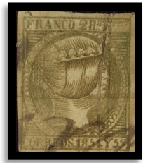
2 Reales yellow green