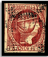
10 Cuartos carmine