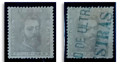
Amadeo de Savoy

Three years later, the first perforated stamps featured the portrait of a crowned woman as an allegory for the New Spanish Republic. In 1872, stamps featuring the portrait of King Amadeo de Savoy were issued along with the first inscription of "Filipinas".