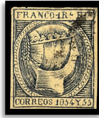
1 Real ultramarine