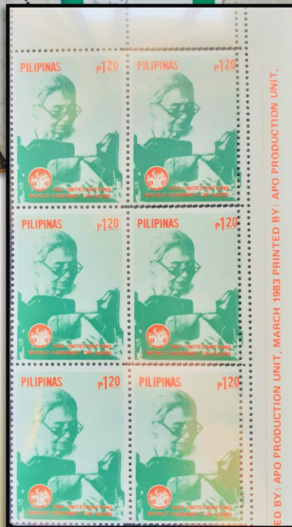
Double perf error