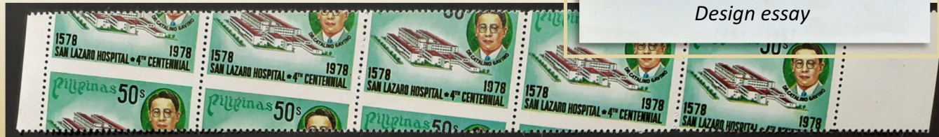
Slanting horizontal misperforation error