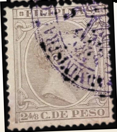
Obras Pias De La Sagrada Mitra Del Arzobispado De Manila