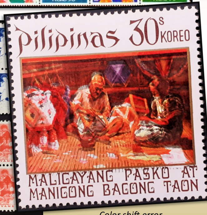
Color shift error