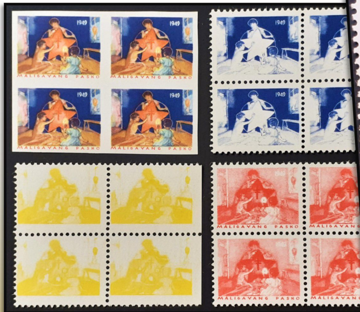
Color proofs, Christmas charity stamp, 1949