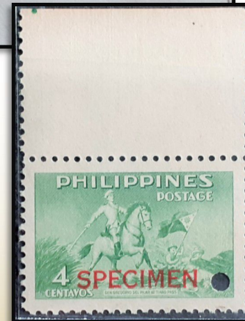
Black proof and SPECIMEN, American Bank Note Co., 1949

Faith, Hope and Charity: Conquest of the Philippines