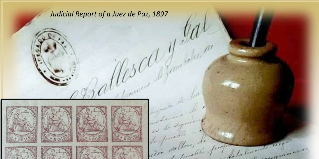
Judicial Report of a Juez de Paz, 1897