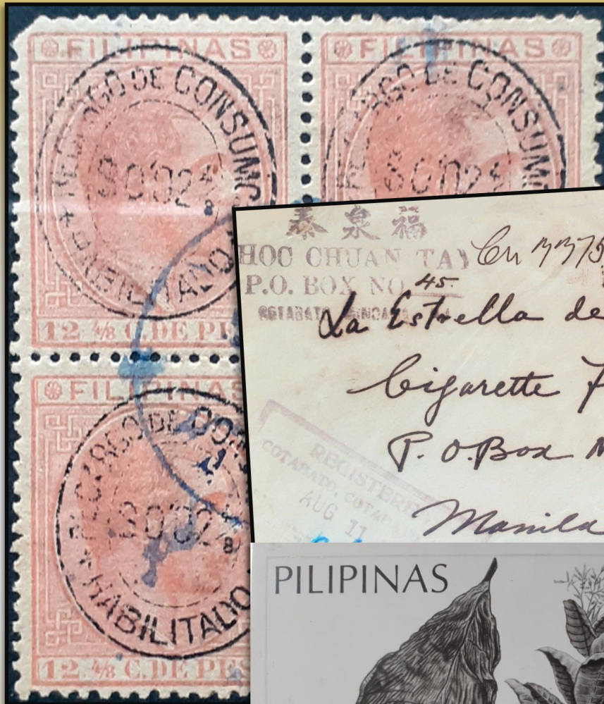
Recargo de Consumos (Stamp tax for tobacco)