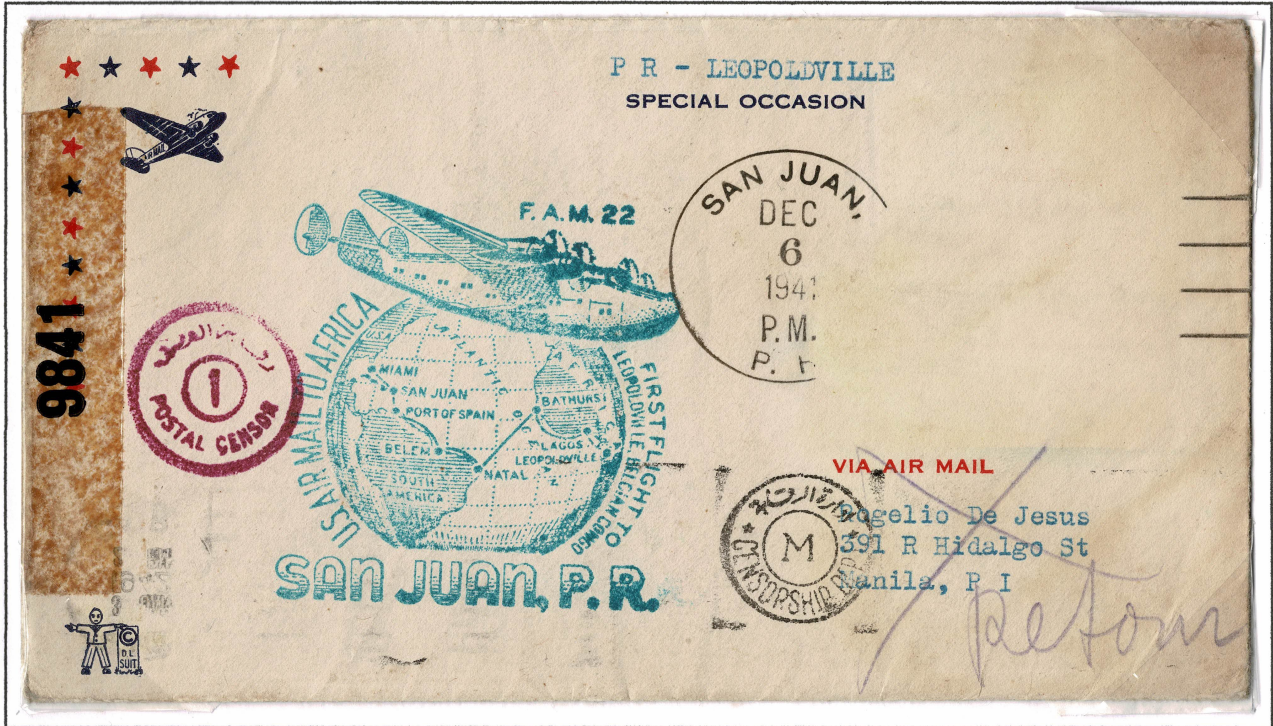
San Juan, Puerto Rico, 6 Dec 1941, addressed to Manila. Returned from Leopoldville to USA.

The new route from USA to Leopoldville by FAM 22 raised the possibility of a new route to the Philippines, by connecting with the British Horseshoe route. Japan attacked just after this letter was mailed. After reaching Leopoldville, the letter was returned to its sender. The U.S. censor made a note that stamps were missing.