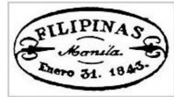
Dated Oval black " FILIPINAS - Manila " Used Between 1842 - 1844