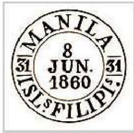
Black Baeza " MANILA - 31 - ISL. s FILIPI. s Used Between 1853 - 1862. Measuring 29.5 mm Diameter

1860 JULY 18 LINGAYEN, PANGASINAN to MANILA