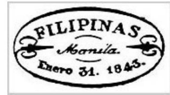
Dated Oval black " FILIPINAS - Manila " Used Between 1842 - 1844