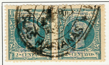
2c inverted overprint at right