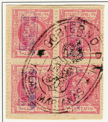
5c block all inverted overprints