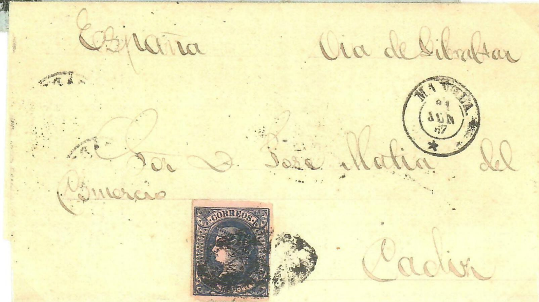
1861 and 1867 Manila to Cadiz, Spain letters by British ship via the British port of Gibraltar.