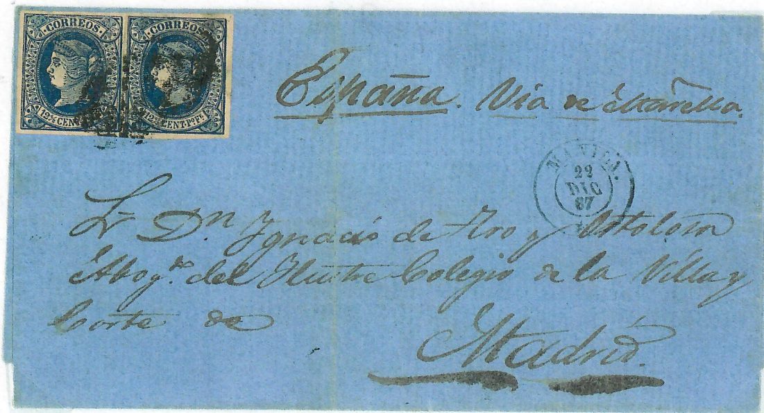
1867 Manila to Madrid, Spain by Spanish ship via the French port of Marseilles.