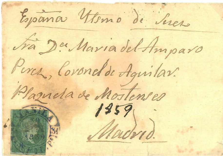
1859 Manila to Madrid, Spain by Spanish ship via the Spanish port of San Roque.