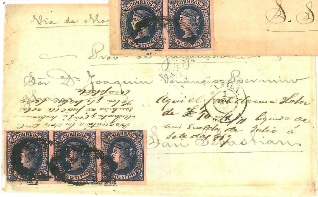
1867 Manila to Spain letters.