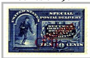
10c Special Delivery 50 Pieces