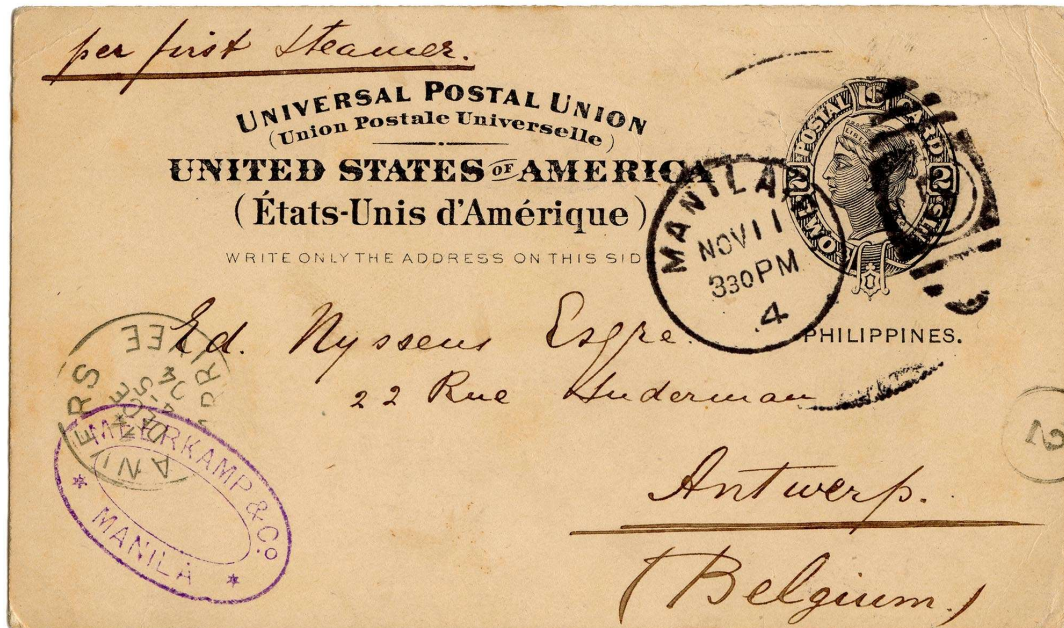
Manila 11 November 1904, to Antwerp, Belgium. Private business handstamp and receiving cancel on front. The card shows a plate variety: Partially missing grommet.