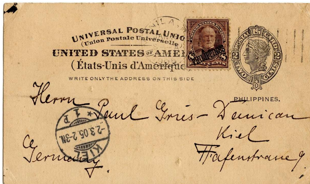
Manila 28 January 1905, to Kiel, German Empire. The card was additionally franked with 8 Cents, probably intended for registry fee. However, the card was treated as ordinary mail.