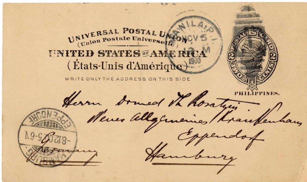
Manila 5 November 1900, to Hamburg-Eppendorf, German Empire.