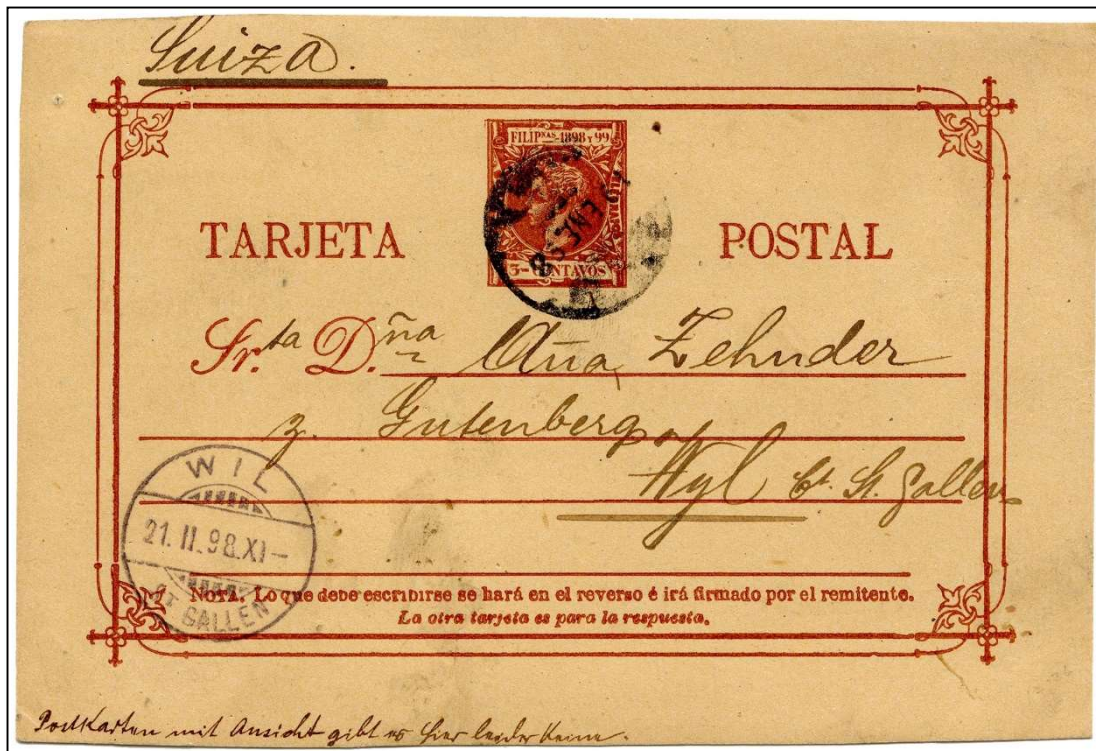
Paid reply postal card, message half, at 3 Centavos de Peso. The card was cancelled on 19 January 1898 in Manila. It was carried by the Spanish ship Isla de Mindanao to Europe and arrived in Wil, Switzerland about one month later. Of the 3 Centavos denomination, three recorded used message half cards are known.