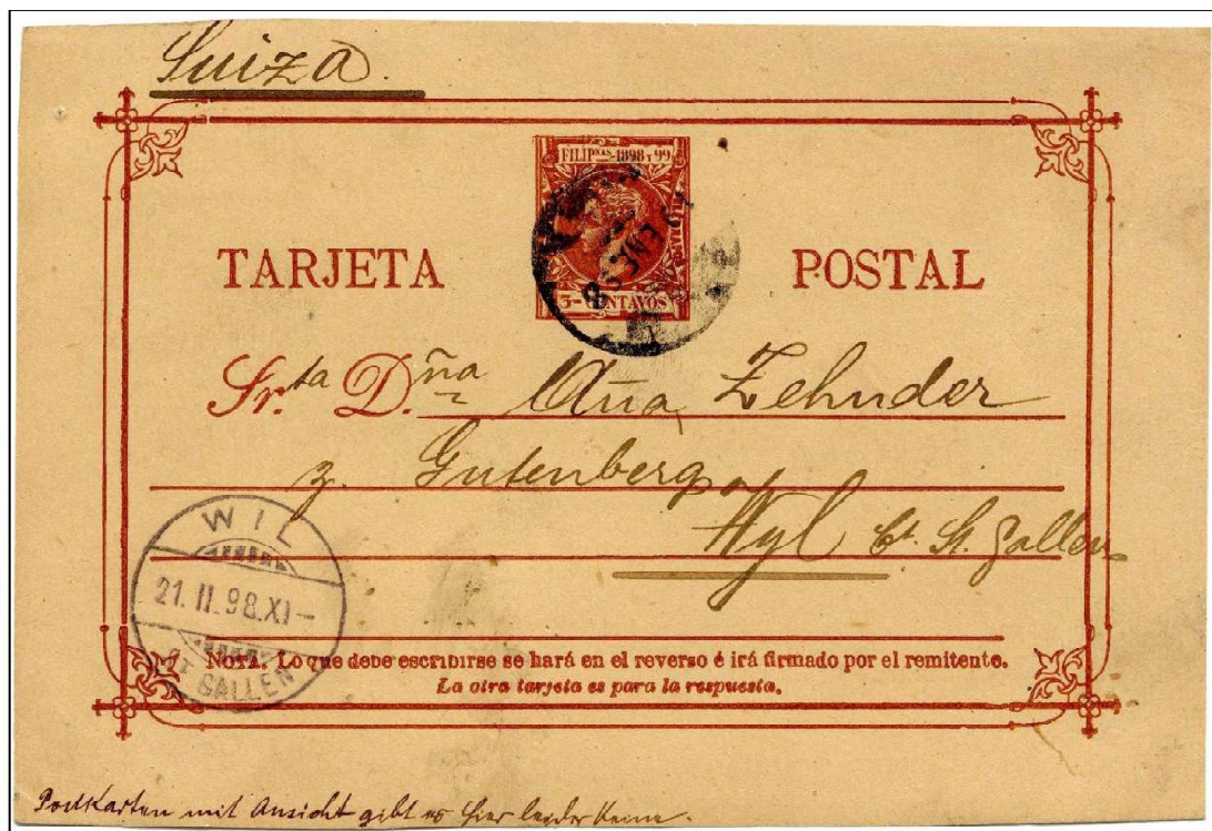
Paid reply postal card, message half, at 3 Centavos de Peso. The card was cancelled on January 19, 1898 in Manila. It was carried by the Spanish ship Isla de Mindanao to Europe and arrived in Wil, Switzerland about one month later. Of the 3 Centavos denomination, three recorded used message half cards are known.