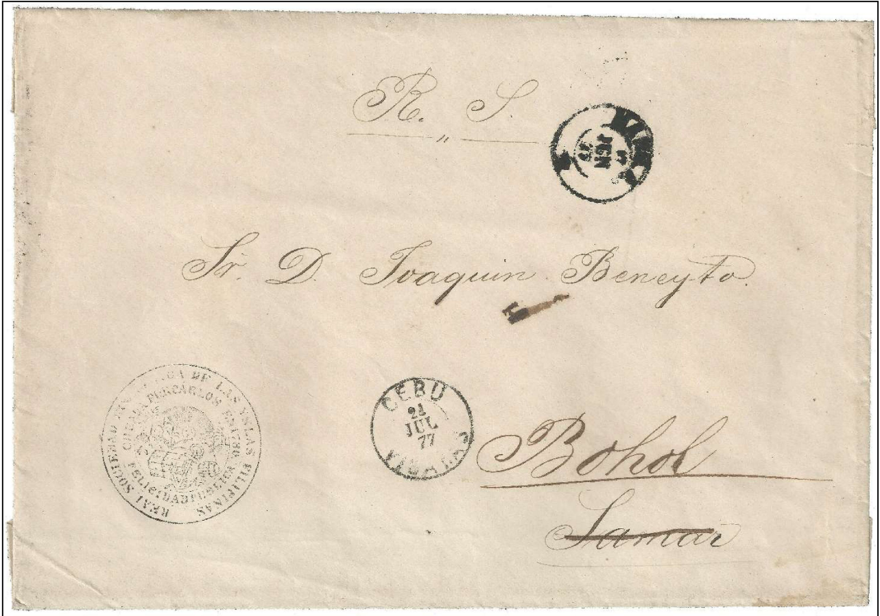
Envelope sent by the Royal Economic Society of Friends of the Country, stamped Manila June 17, 1877 to Bohol. At the way to the addressee a scarce "CEBU / VISAYAS" circular date stamp was applied on July 21.

Official mail, sent under free franking privilege, was usually marked, for example "R.S." (Real Servicio).