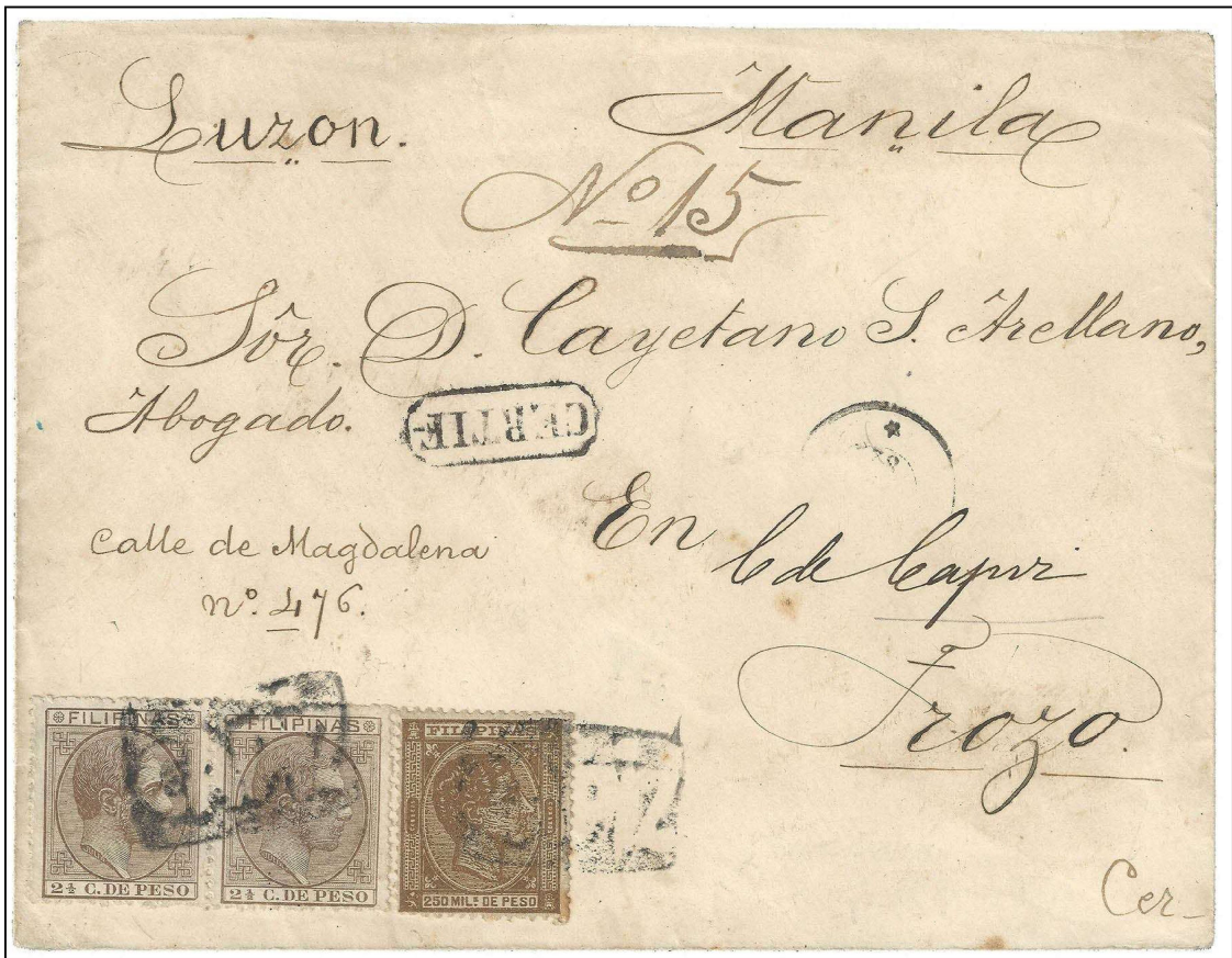
Registered cover sent from Capiz January 1882 to Manila. The cover was franked with a stamp at 250 Milesimas de Peso of the second series of King Alfonso XII, issued from 1879 onwards as well as a 2 1/2 Centavos de Peso pair of the third series of King Alfonso XII, issued from 1880 onwards. Only recorded cover with the 250 Milesimas de Peso stamp.

The stamps were tied by boxed negative "CAPIZ". Two covers with this rare marking are recorded. A strike of framed registration marking "CERTIF" and a date cancel were applied in Manila.