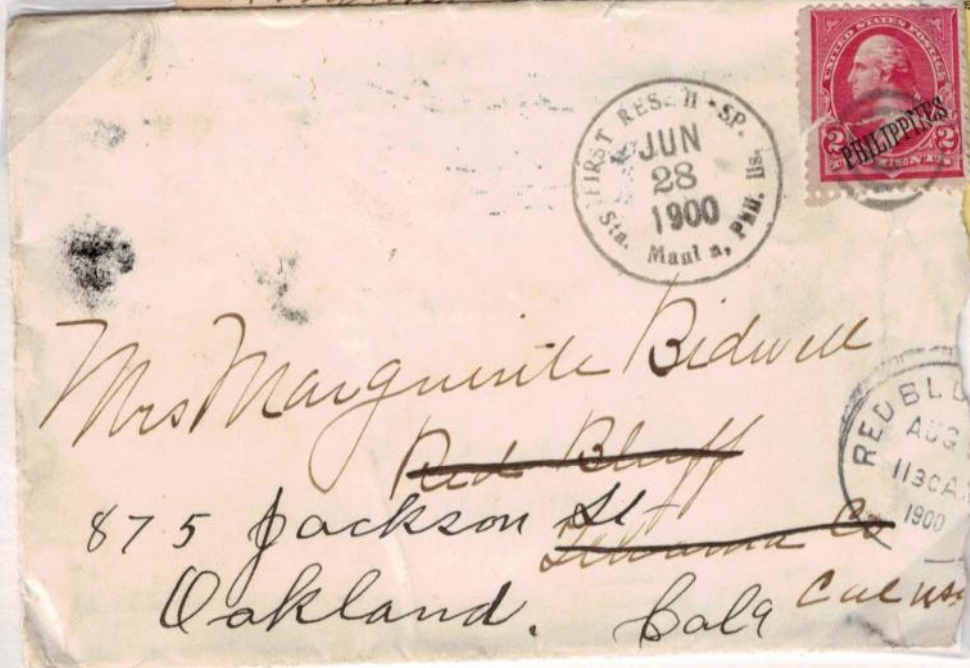
The First Reserve Hospital Branch post office operated during the military occupation of Manila. Although Goodale states that the postmark is always missing the "o" of "Hosp." this is incorrect as shown on the upper cover dated 5 February 1900. Shortly thereafter, the "o" fell out and the subsequently recorded strikes (from 6 February 1900 to 14 March 1901) are without "o." Red cancel used as receiving mark; one of two examples.