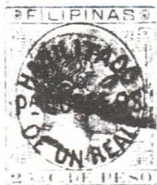
Figure 2. Proposed Scott #94A. Used stamp with indiscernible cancel. Although the surcharge type is not listed by Bartels et al. (1904), it is assigned a new number, XIII B. Surcharge type different from #94A (Figures 1 and 3). R. Miggins collection (1994).