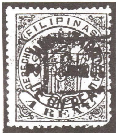
Figure 13. Proposed Scott #129A. Used stamp cancelled with a black type 6 certificado handstamp (Peterson, 1988/1989). Surcharge type similar to Bartels et al. (1904) type XII, for Scott #103 and 104. Surcharge type similar to #129A (Figure 14). N. Gooding collection (1994).