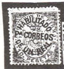
Figure 12. Proposed Scott #119A. Mint stamp. Surcharge type similar to Bartels et al. (1904) type XII, for Scott #103, 104, and 126. Surcharge type similar to #119A (Figures 10 and 11). R. Miggins collection (1994).