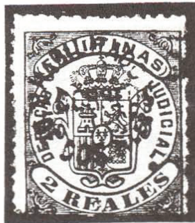
Figure 16. Proposed Scott #129B. Mint stamp. Surcharge type similar to Bartels et al. (1904) type XVIII, for Scott #94. D. Peterson collection (1994).