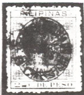
Figure 4. Proposed Scott #99A. Used stamp with black padilla cancel. Surcharge type similar to Bartels et al. (1904) type XXIV for the 8c surcharge, and type XIII for the 1r surcharge. D. Peterson collection (1994).