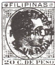
Figure 8. Proposed Scott #104A. Mint stamp. Although the surcharge type is not listed by Bartels et al. (1904), it is assigned a new number, XIID. Surcharge type similar to #104A (Figure 9). R. Miggins collection (1994).