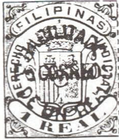
Figure 15. Proposed Scott #129A. Mint stamp. Although the surcharge type is not listed by Bartels et al. (1904), it is assigned a new number, XIIIIC. Surcharge type similar to #104A (Figure 7). R. Miggins collection (1994).