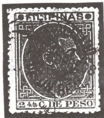
Figure 3. Proposed Scott #94A. Used stamp with circular date cancel. Although the surcharge type is not listed by Bartels et al. (1904), it is assigned a new number, XIII A. Surcharge type similar to #94A (Figure 1). N. Gooding Collection (1994).