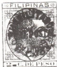
Figure 5. Proposed Scott #99A. Mint stamp. Surcharge type similar to Bartels et al. (1904) type XXIV for the 8c surcharge; however, the 1r surcharge type is not discernible. R. Miggins collection (1994).