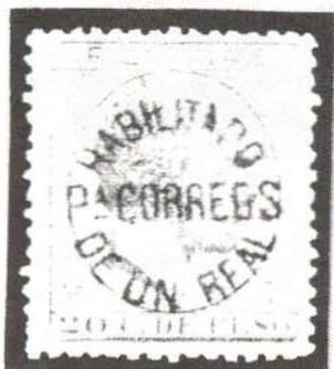
Figure 6. Proposed Scott #104A. Mint stamp. Surcharge type similar to Bartels et al. (1904) type XII, for Scott #103 and 104. D. Peterson collection (1994).