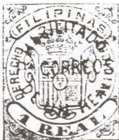
Figure 14. Proposed Scott #129A. Mint stamp. Surcharge type similar to Bartels et al. (1904) type XII, for Scott #103 and 104. Surcharge type similar to #129A (Figure 13). R. Miggins collection (1994).