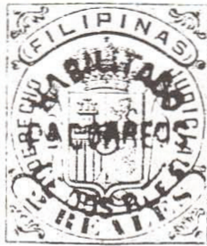
Figure 17. Proposed Scott #129B. Mint stamp. Surcharge type similar to Bartels et al. (1904) type XX, for Scott #94. R. Miggins collection (1994).