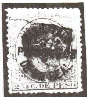
Figure 1. Proposed Scott #94A. Used stamp cancelled with a black Type 2 certificado handstamp (Peterson, 1988/1989). Although the surcharge type is not listed by Bartels et al. (1904), it is assigned a new number, XIII A. Surcharge type similar to #94A (Figure 3). D. Peterson collection (1994).

If anyone has any copies of the above stamps, photocopies would be appreciated (highlighting the surcharge). Please contact Don Peterson, 7408 Alaska Ave., NW, Washington, DC 20012.