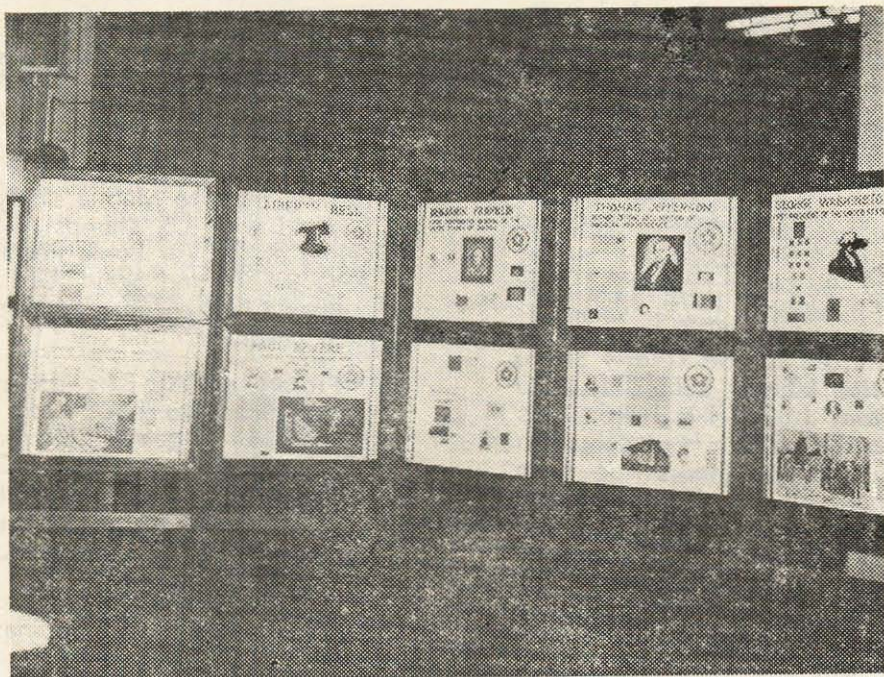
Some of the frames exhibited during Philampex '76