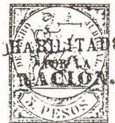
Figure 4 Fake Overprint