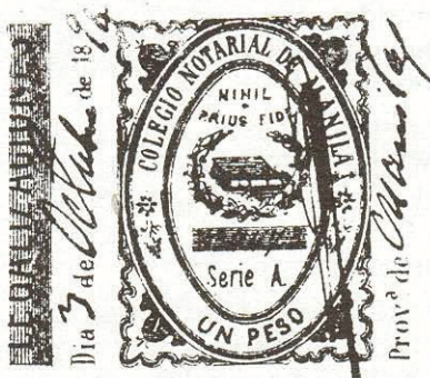
Figure 7 Colegio Notarial de Manila

COLEGIO DE NOTARIAL DE MANILA - A photo of an 1896 Manila Colegio Notarial stamp was received, one peso black, unlisted by Barata, but similar to his 1877 Madrid issue (Barata #199). This is the first colegio stamp reported for the Philippines. Fig 7