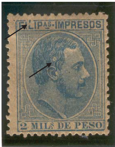
Figure 1. Broken “L” of “FILIP”, broken top frame line, colored dot in hair above ear.

The 2 milesimas blue Philippine newspaper stamp, showing the likeness of King Alfonso XII (Scott #P3), was issued in 1889 in sheets of 100 (10 x 10); and was one of four King Alfonso XII newspaper stamps (#P1-4). More so than the other three, #P3 seems to have had more than the normal share of plate flaws. This article describes three of those plate flaws that are repetitive. In other words, the plate flaws occur in the same position on more than one sheet. I have several similar #P3 stamps showing these flaws in my collection. There are other repetitive plate flaws on #P3 and on other King Alfonso XII newspaper stamps, but this will do for now.