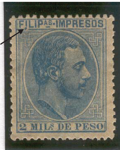
Figure 2. Colored dot below first “I” of “FILIP”.