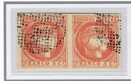
LARGEST RECORDED MULTIPLE

Gooding #6F7. A quite commonly found forgery. The bottom part of the 'C' in 'CORREOS' consists of a straight line with no curve. The top horizontal line in '5' of '1854' is thin. The top of the '4' is thick. Serifs in '55' do not incline upward and are away from the upper line. The left vertical line in 'N' of 'FRANCO' is bent at the top. The bottom curve of the 'C' in 'FRANCO' is very thin, ending with in a large dot. The second horizontal line in the lower right spandrel is short and does not touch the right frame line.