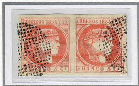
LARGEST RECORDED MULTIPLE