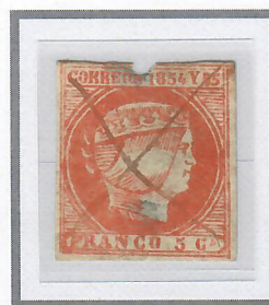
ONLY RECORDED COPY

Gooding #6F8. The 'C' in 'CORREOS' is rounded and almost closed. The '4' of '1854' is small, with the vertical line somewhat curved. The 'Y' is taller compared to the numerals either side. The numbers '55' are small and the serifs do not incline upward and are away from the upper line. The 'N' in 'FRANCO' is broken at the top left corner and the 'O' is smaller in comparison to the other letters. The horizontal serif at the top of the '5' appears as a curve.