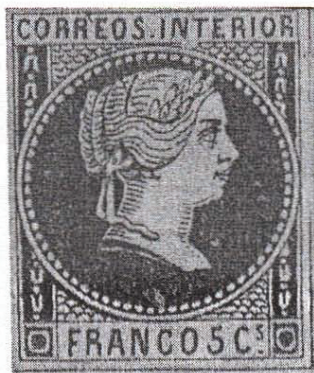
Figure 2. Fourth variety of stamp, showing the scratch across the fillet in the hair of Scott # 10 and 11.

The following is a description of the printings for Scott # 10 and 11.