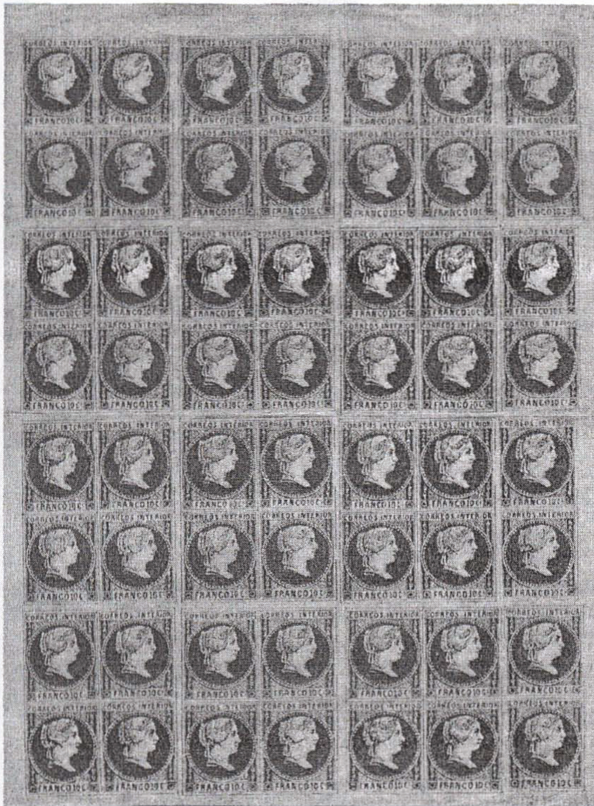
Figure 11. Full Sheet of the Modified First Printing of Scott #11 (Don Peterson Collection).