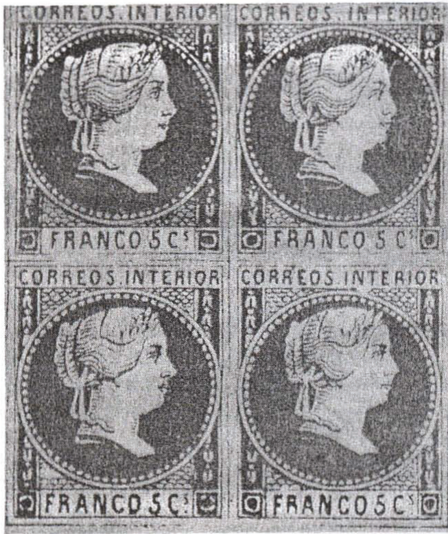
Figure 1. The position of the four varieties of stamps printed in a block of four of Scott # 10 and 11.