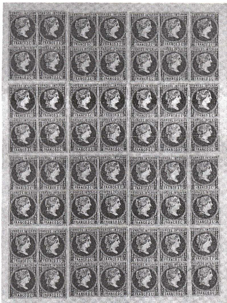
Figure 4. Full sheet of the First Printing of Scott #10 (Filatelia Hobby Auction 13 of December 20, 1979).