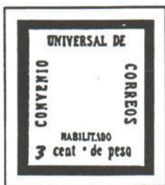
Figure 2. 3-Centavos de peso surcharge on the September, 1879, postal card.

typeset and was done in Manila as we shall later discuss. The words of the surcharge “CONVENIO UNIVERSAL DE CORREOS” mean “Universal Postal Union.” The word “HABILITADO,” which appears on many stamps of Spain and her colonies, means that the stamp was revalidated and made legal for use, usually to validate a change in the government or monetary system. In this case, it validated the use of the new UPU system, specifically the new UPU rates.