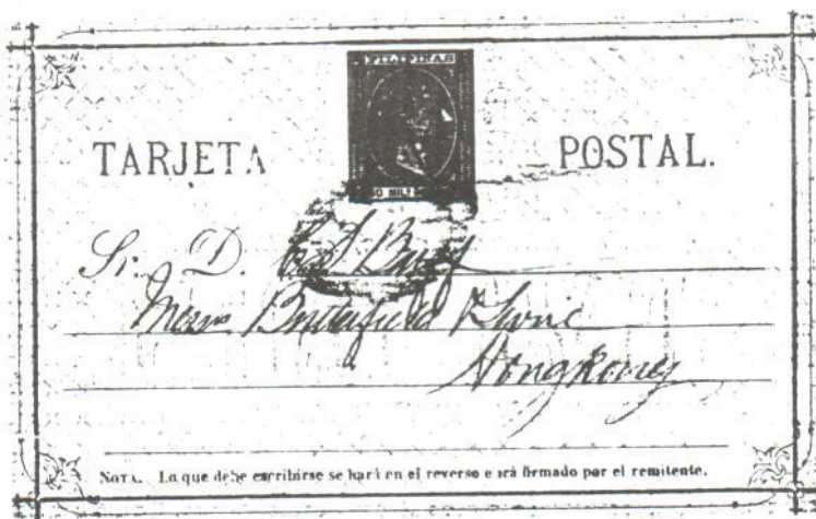
Figure 5. Used example of the 50-miles unsurcharged card. Manila to Hong Kong, dated August 1881.