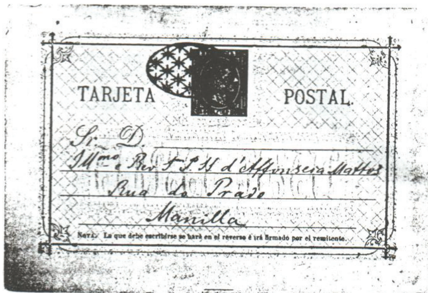
Figure 1. Used example of the first official Philippine postal card — 3-centavos de peso value surcharged on an earlier but unissued 50-milesimas card. Manila local, dated November 1879.

On the bottom of the card is the inscription “NOTA. Le que debe escribirse se hare en el reverso é irá firmado por el remitente,” roughly meaning “write on the reverse side and leave the signature of the sender.” The bottom inscription is usually 90 mm. long, but varies. These features are all enclosed by a double-lined frame with fancy floret-type corners. The frame is 119 mm. by 74 mm. The size of the card varies, depending on how it was cut, but is usually 145 mm. by 98 mm. The card was printed at the Fabrica Nacional de Sellos (National Stamp Factory) in Madrid.