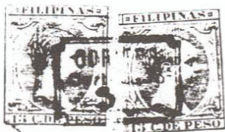
FIGURE 4. Example of Type 16 on Scott #170 (D. Peterson collection).