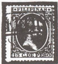
FIGURE 3. Example of Type 15 on Scott #170 (D. Peterson collection).