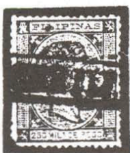
FIGURE 1. Example of Type 3 on Scott #199 (D. Peterson collection).