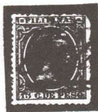
FIGURE 5. Example of Type 17 on Scott #171 (D. Peterson collection).

If you have any additional information on certificado handstamp types, please contact Don Peterson, 7408 Alaska Ave., N.W., Washington, DC 20012. ■