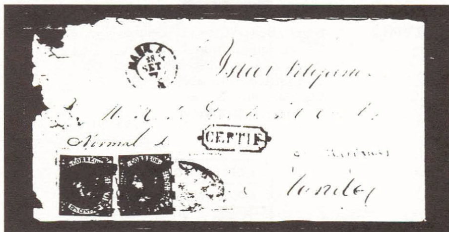
Figure 1. 1877 (September 28) Marianas to Manila letter showing earliest known use of registration handstamp (Type 1) (from author's collection).

The rates and procedures for registration were first promulgated in 1854. The first registration handstamps appeared in 1877. For additional information on registered mail of the Spanish Philippines, refer to Peterson (1982, 1983). An up-dated and more complete discussion of postal rates, including those for registration between 1879 and 1898, is addressed in another article by Peterson (1984). See bibliography.