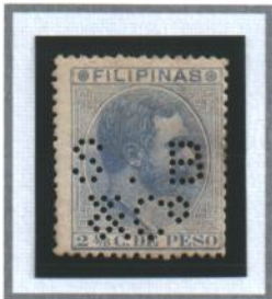
Scott #79 (Mint)