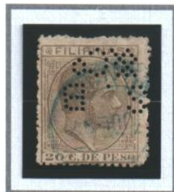
Scott #87 (Inverted) Manila CDS