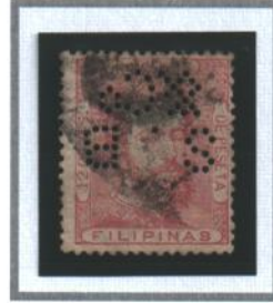
Scott #43 (Inverted)