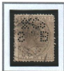
Scott #87 (Inverted) Iloilo CDS