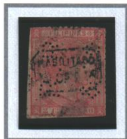
Scott #59 (Sideways)