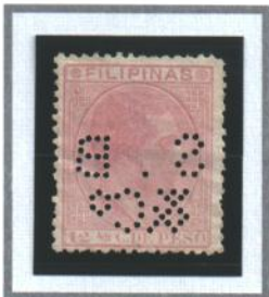
Scott #86 (Inverted)