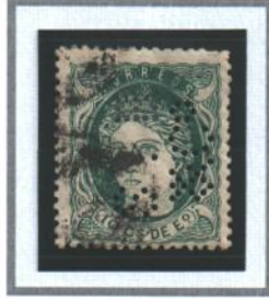
Scott #40 (Sideways)