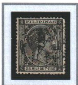
Scott #62 (Inverted)