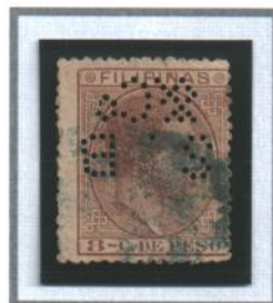
Scott #83 (Inverted)