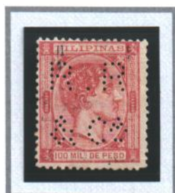
Scott #73 Surcharge 98% Omitted