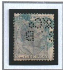
Scott #81 (Inverted)