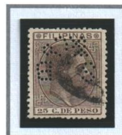
Scott #88 (Inverted)