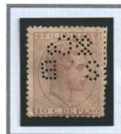
Scott #85 (Inverted)