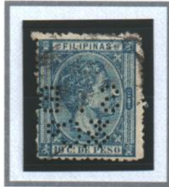
Scott #55 (Inverted)