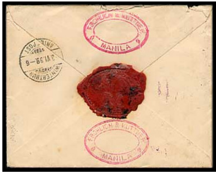
5 May 1899 - Manila to Winterthur, Switzerland Military Station Registration Circular Date Stamp. Backstamped with 3 June 1899 Winterthur CDS Red Business Handstamp (BH3) Applied on Reverse of Cover