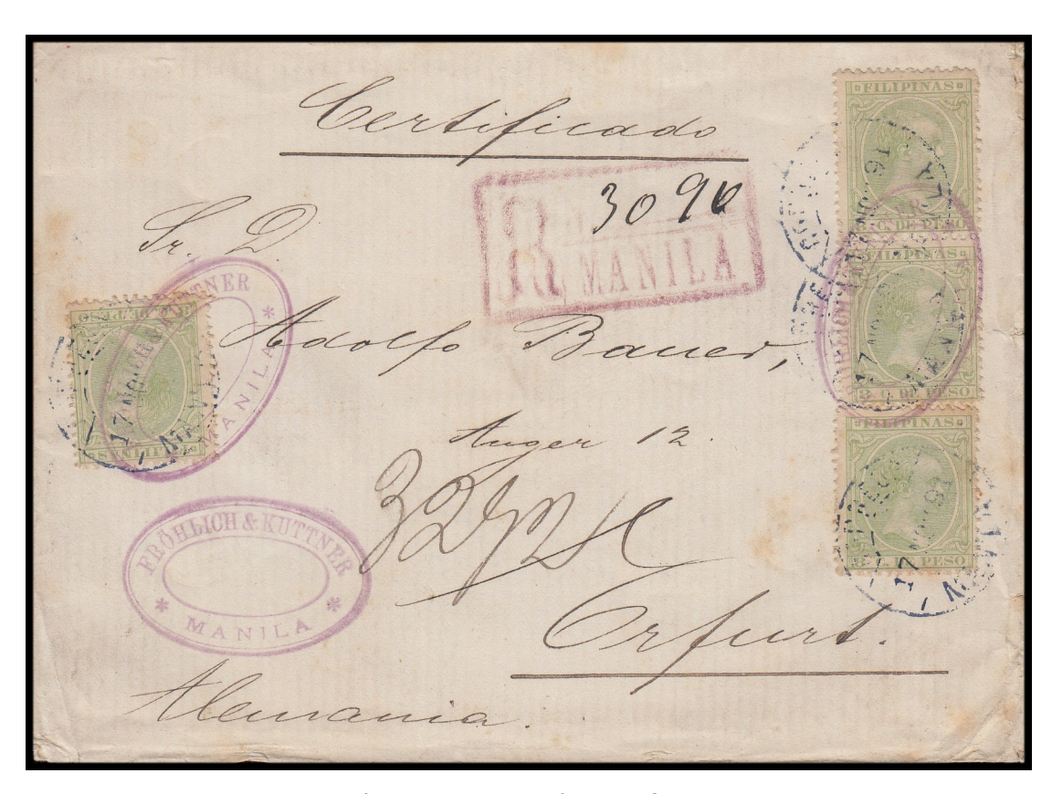
17 November 1891 - Manila to Erfurt, Germany

'Correos - Manila' Departure Circular Date Stamps with Boxed Registration Cancel Alongside Erfurt (21 December 1891) Receiving Circular Date Backstamp Purple Business Handstamp (BH2) Applied on Cover Front