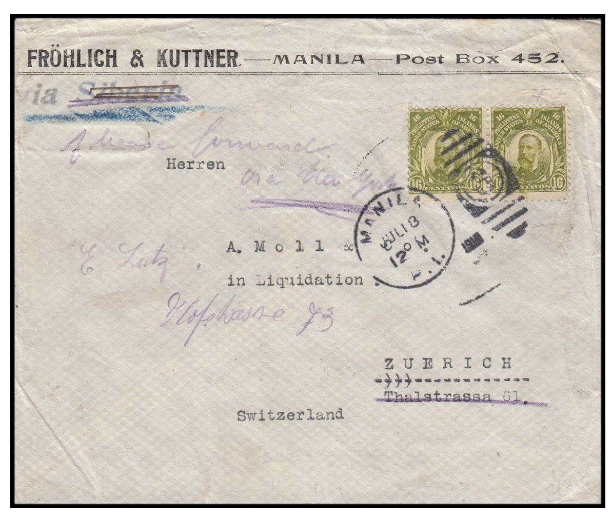
18 July 1914 - Manila to Zurich, Switzerland

FRÖHLICH & KUTTNER - MANILA - Post Box 452. in Single Line