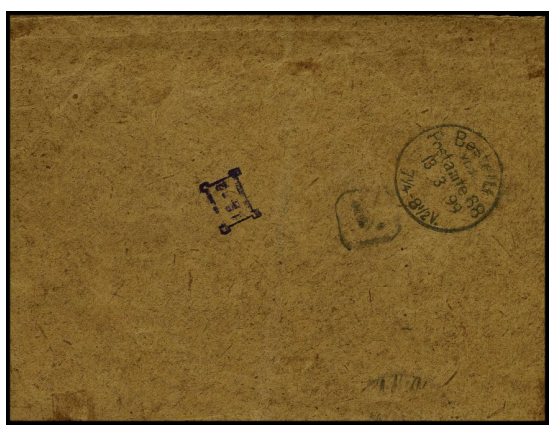
Registered Cover from Manila to Berlin, Germany (Addressed to Fröhlich & Kuttner) 13 March 1899 Receiving Circular Date Backstamp (HR Harmer Auction – 17 May 2018)